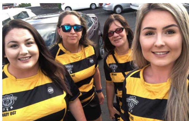
2019 KIWI CAN LEADERS

"THANK YOU FOR EVERY- THING YOU HAVE ORGANISED FOR US ALL THIS TERM. I LOVE SEEING THE CLASS HAVING SUCH FUN LEARNING IMPOR- TANT LIFE VALUES AND SKILLS FROM YOU."