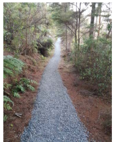
Photos: Before and after regravelling.