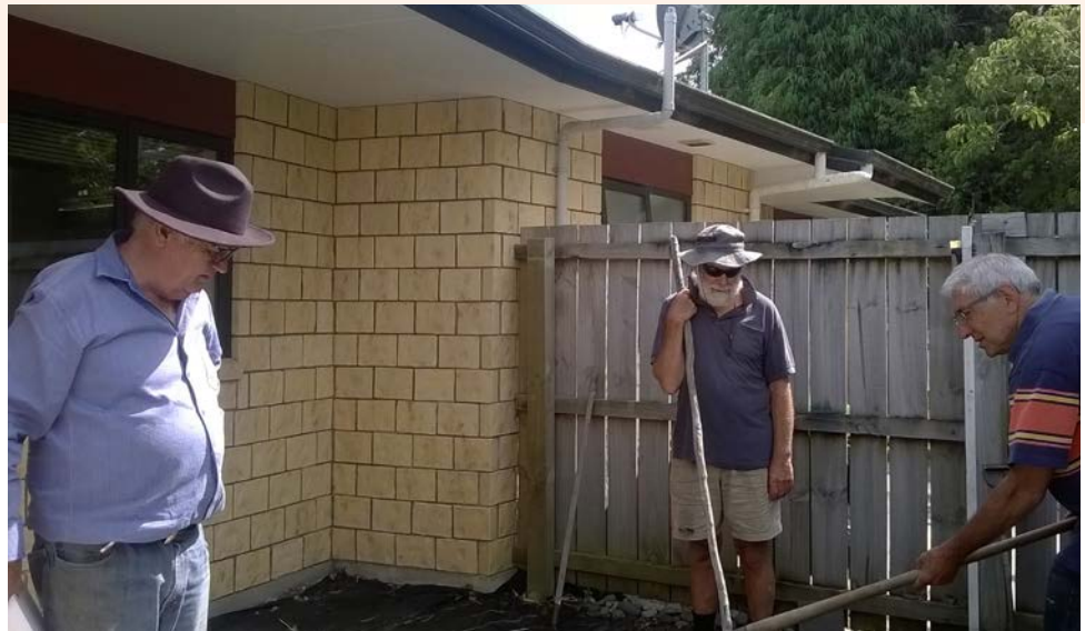
Volunteers giving one of the flats a bit of a spruce up

We are always looking for innovative ways to meet the housing needs of people in the Upper Coromandel Peninsula. We have identified a need for emergency housing and also group housing for individuals who would suit a group environment better than living on their own. Opportunities to meet these needs continue to be investigated