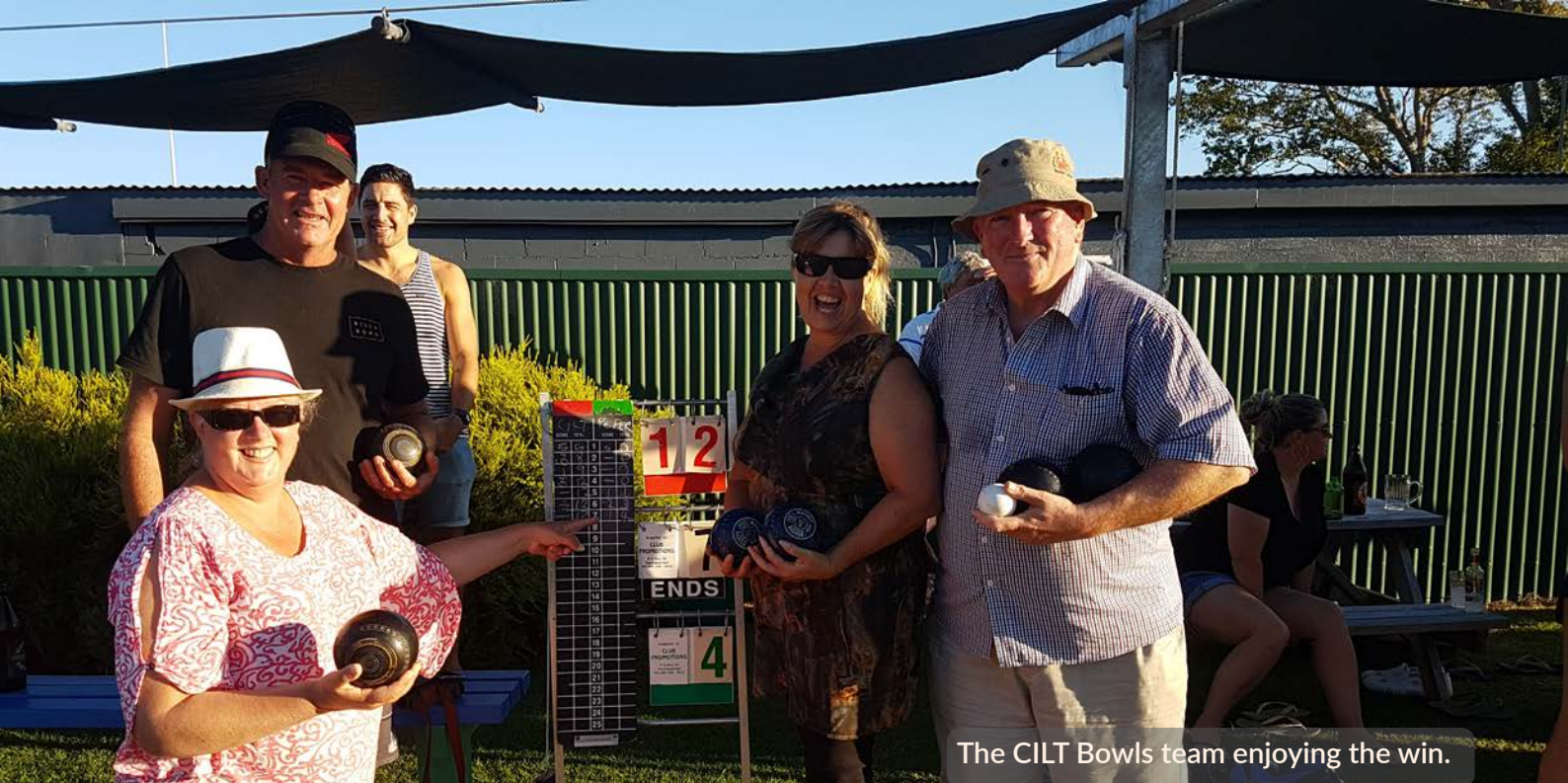
The CILT Bows team enjoying the win.