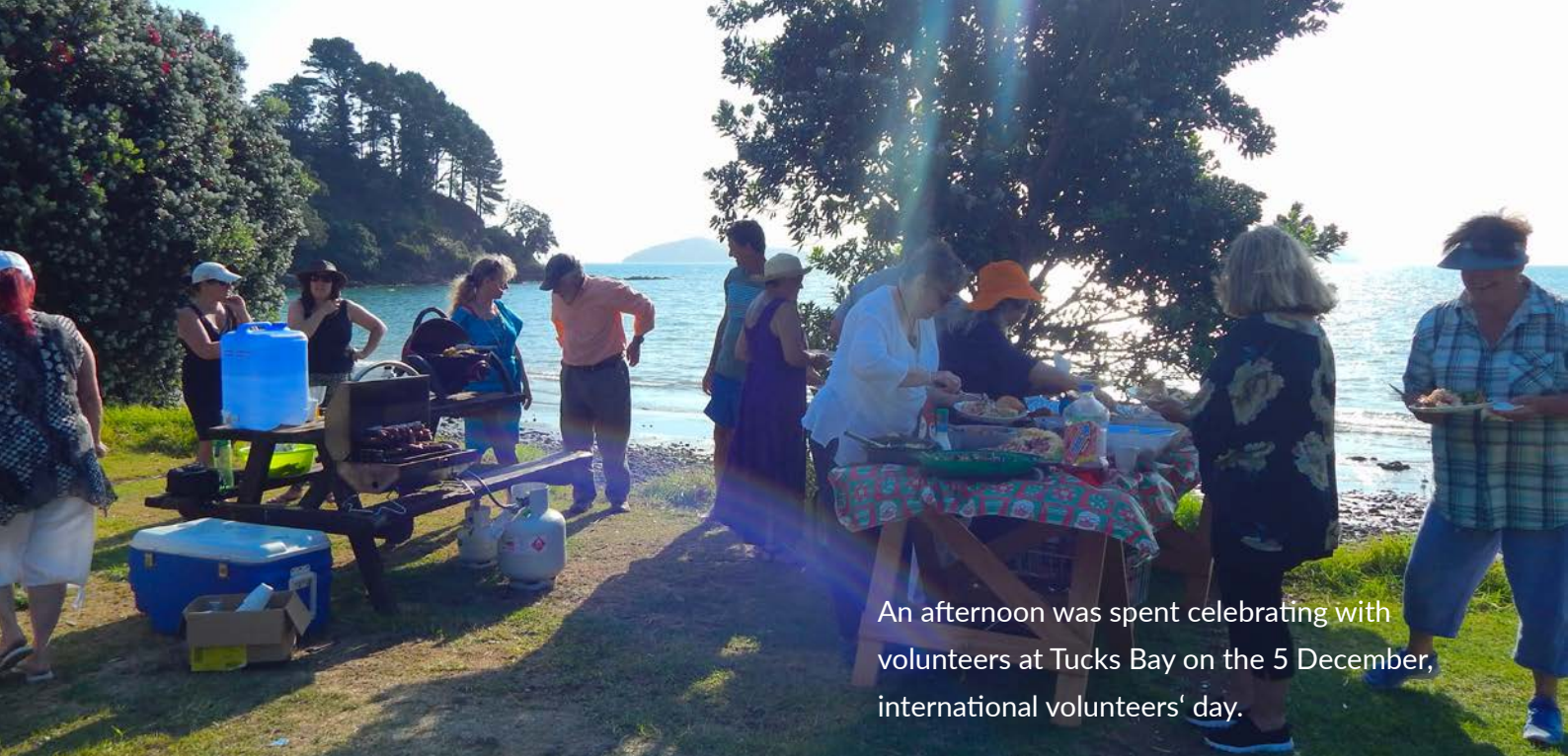
An afternoon was spent celebrating with volunteers at Tucks Bay on the 5 December, international volunteers' day.